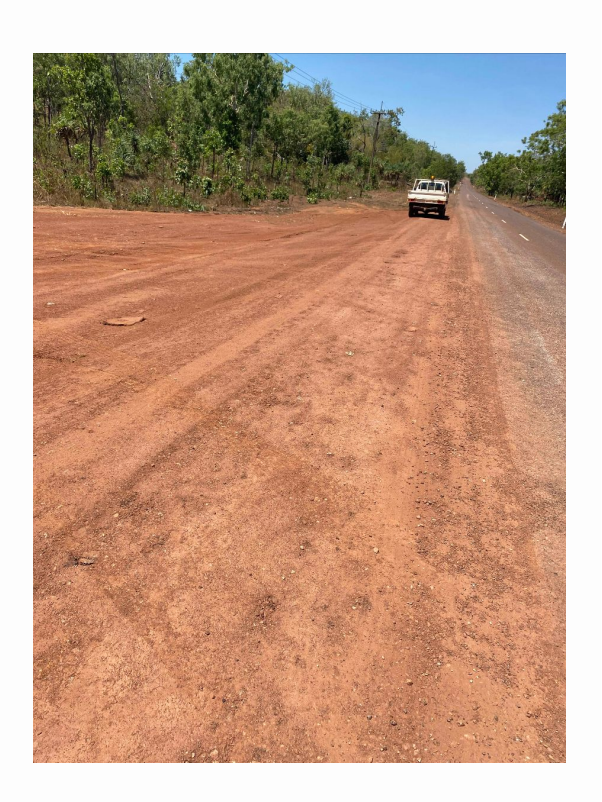
Local Period Contractor Ooloo Contracting, hard at it improving the safety of Chinner Road and the access to the Chinner Road Bus Stop.